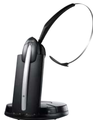
Jabra GN9330e Over-the-head (headband)

With a range of up to 325 feet, you can take your calls throughout your office. The Jabra GN9330e allows you to escape the limitations set by your conventional telephone handset, providing hands-free mobility, all-day comfort and superb sound clarity.