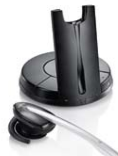
Jabra GN9330e On-the-ear (ear hook)